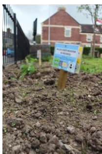
Thinking about Maintenance

Have a look through the following resources to help get your school project underway: