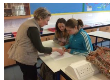
Grounds Development Happen