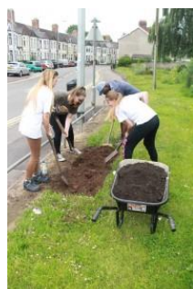
Working with Volunteers